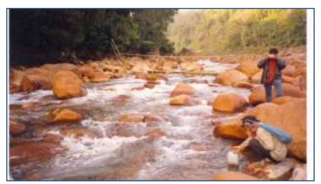
Figure-6, Acidic nature of Myntdu river and its tributaries

generating units. The work of assessing the water quality of Myntdu River and its tributaries in catchment area for its long-term effect on durability of concrete was assigned to Central Soil and Materials Research Station (CSMRS) as the pH of water was found to the abnormally low in the range 3.6 to 5.0. In this connection, water samples were collected at regular intervals such as monsoon, pre-monsoon and post – monsoon. The source of the acidic water was identified to be surface runoffs from the surroundings coal mines either sides of the main Myntdu River. The acidic water flowing in Myntdu River is presented in figure 6.