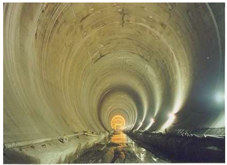
Figure-5 The Head Race Tunnel (HRT)

The Head Race Tunnel (HRT) was constructed adopting CSMRS recommendations is presented in figure 5.