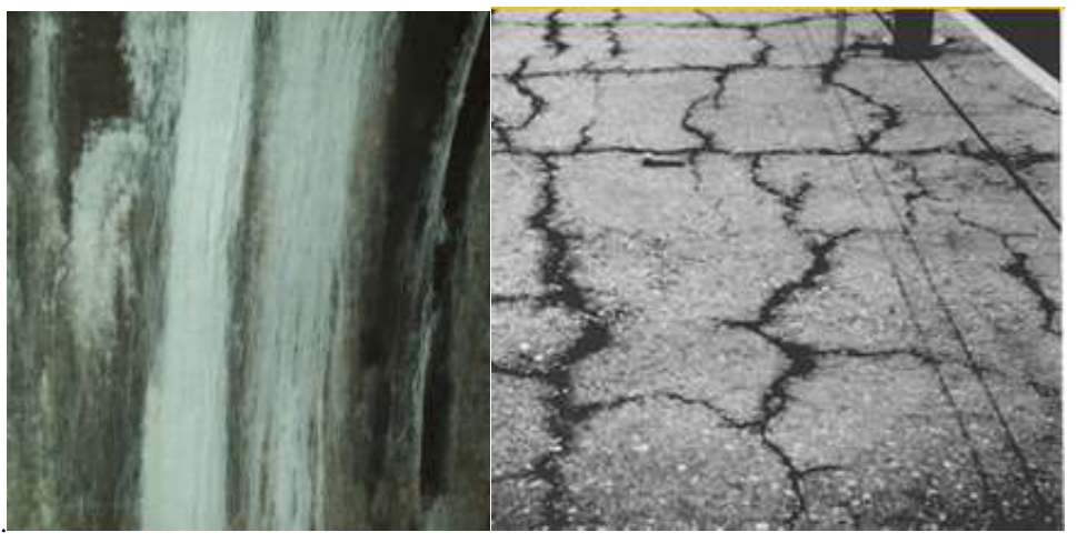
Figure-1, Lime Leaching in Dam Galleries

Water plays an important role in the production of concrete. The chemical reactions between cement and water enable the setting and hardening of cement, resulting in a binding medium for the aggregates and development of strength. Two important requirements of concrete are durability and strength. The durability of cement concrete is its ability to resist weathering action, chemical attack, abrasion or any other process of deterioration. The presence of Soluble sulphates, Chlorides and other salts in concrete pore water results in to severe damage to the concrete structures and causing durability issues. The ingress of acidic water causing corrosion of steel renforcement.Fig.1 -4.Presents the damage to concrete due to aggressive chemical exposure.